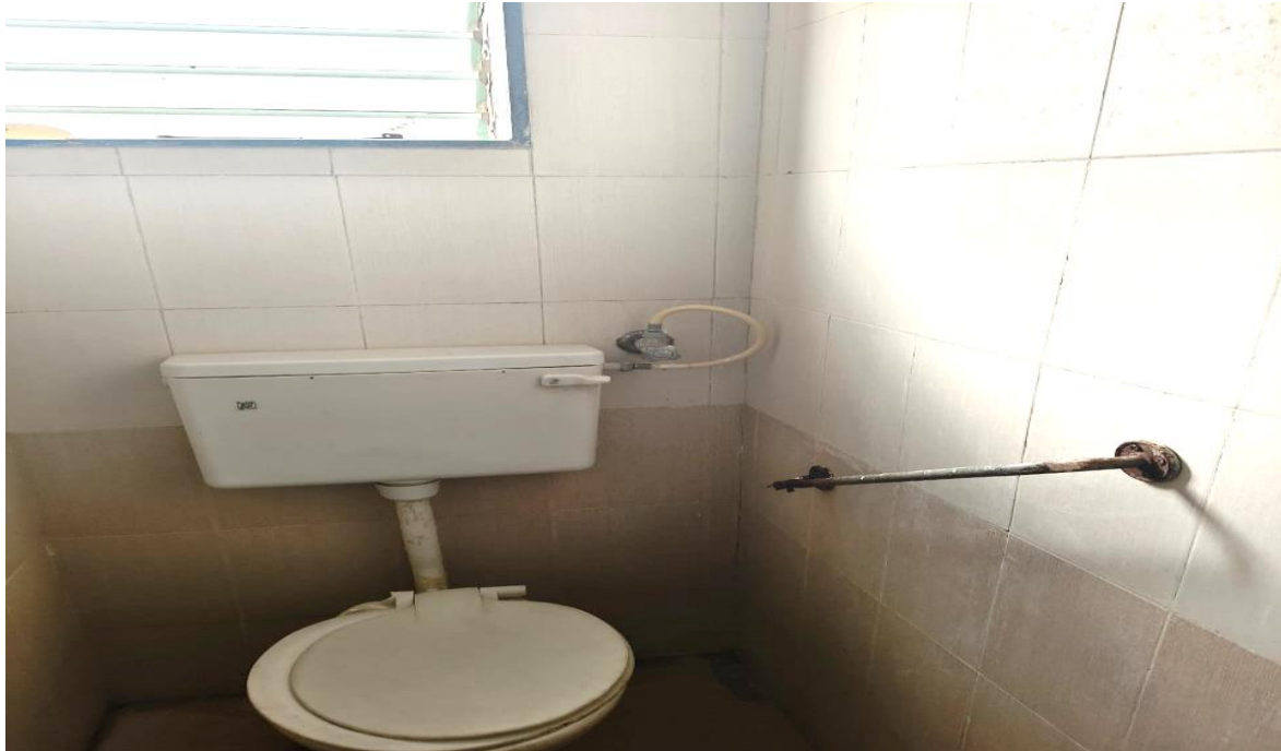
Disabled Friendly Washrooms in the Campus

The college has provided separate Divyangjan-friendly washrooms for ladies and gents. These washrooms are fitted with western commodes and supportive grab bars on both sides for safety. Flush facilities are installed to ensure comfort and hygiene.