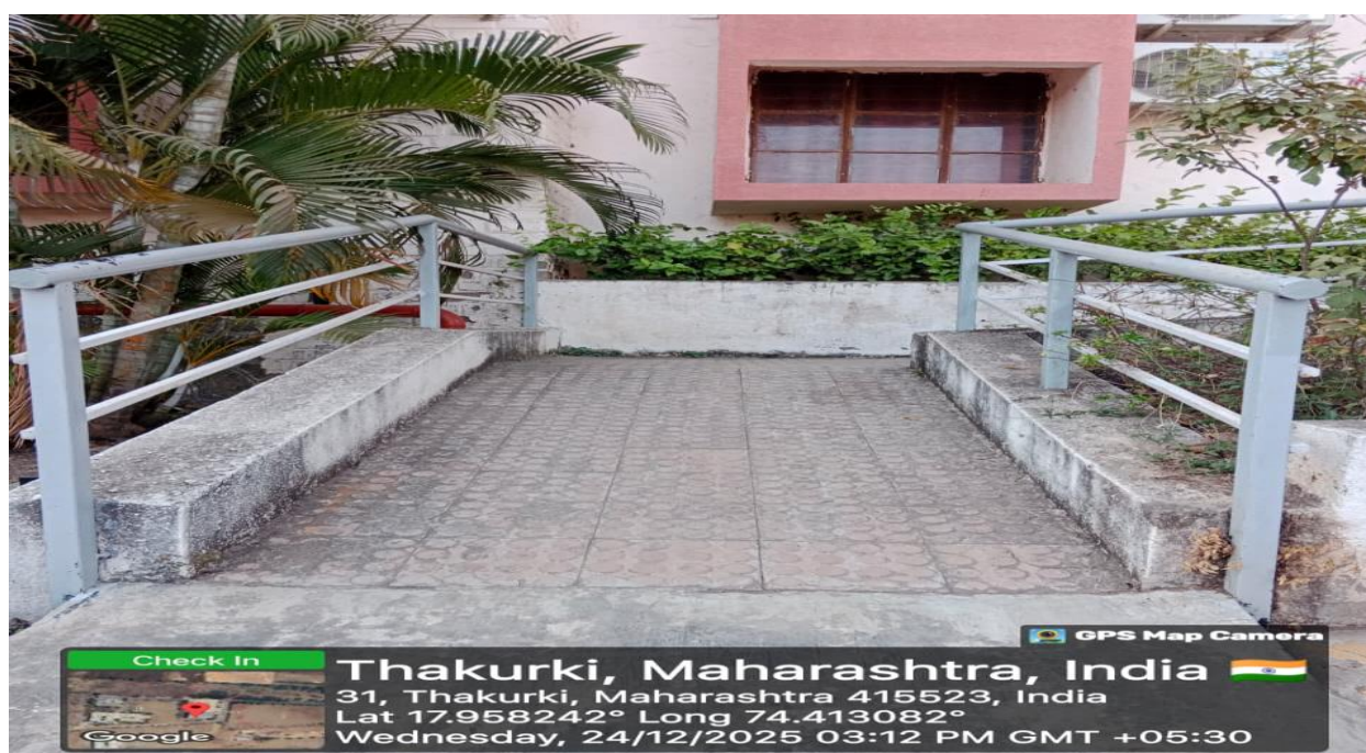
RAMPS FOR PHYSICALLY DISABLED PERSON

To enhance accessibility across the campus, lift facilities have been provided for the convenience of Divyangjan students and staff members.